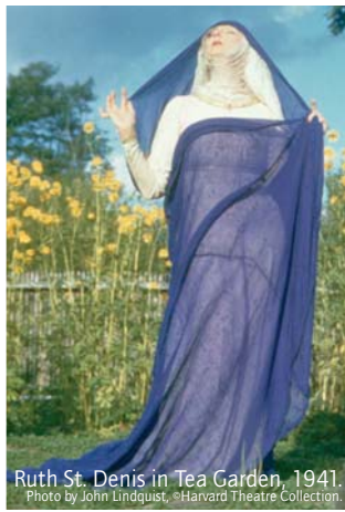
Ruth St. Denis in Tea Garden, 1941.