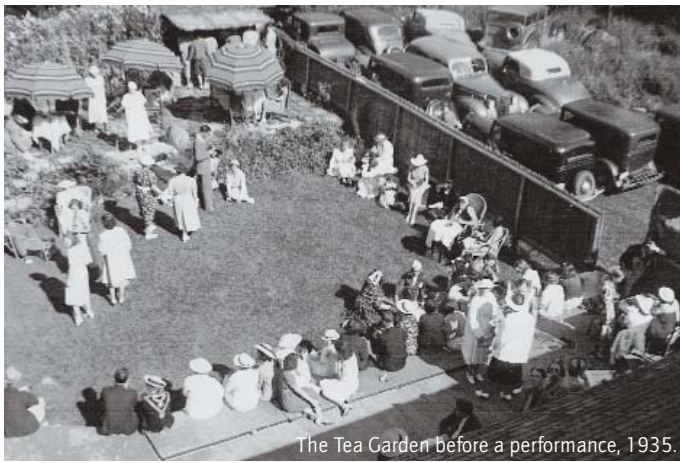
The Tea Garden before a performance, 1935.